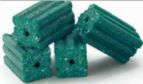
4 blocks is a rat, not a mouse, placement