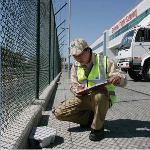
Grey Protecta LP can take the heat in Dubai, UAE

standard black, in order to reduce the high temperature within the station.