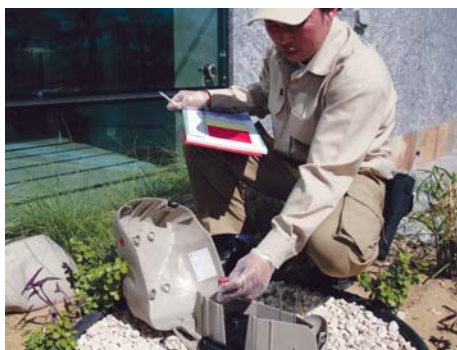
Bell’s FINAL Blox is new in the U.A.E. market.

“Our trials of FINAL were found to be very good,” Baker wrote from Dubai. “We look forward to using and distributing FINAL in conjunction with the other Bell products in order to supply our clients with an adequate range of quality rodent control solutions.” ■