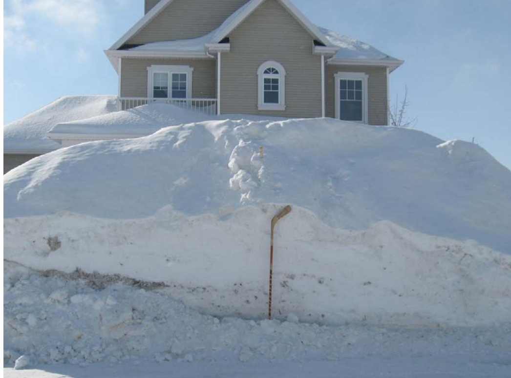
Protecta LPs used outdoors remain buried under record snowfall topping 15 feet this year in Quebec City.

Whatever the climate – from the frigid, bone-chilling temperatures of Canada to the scorching desert heat of the Middle East, Bell's tamper-resistant Protecta LP Bait Station can handle it.