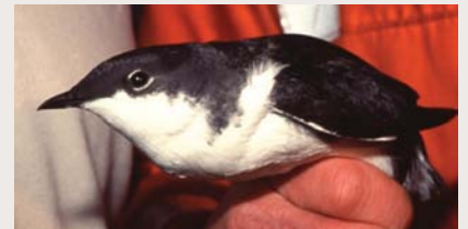
The threatened Xantus’s Murrelet was among the sea bird species that fell prey to non-native black rats on Anacapa Island.