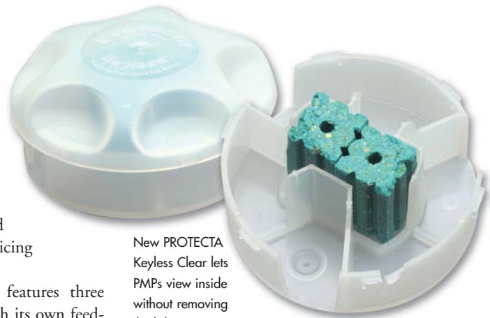
New PROTECTA Keyless Clear lets PMPs view inside without removing the lid.

PROTECTA Keyless Clear features three entry points for mice, each with its own feeding station. Two built-in securing pegs hold two Blox firmly in the station. Several mice can feed simultaneously in separate compartments, which eliminates alpha mouse dominance and provides enough bait for severe infestations.