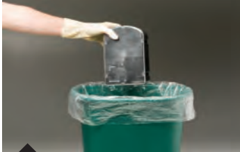
Dispose of station when bait is gone.