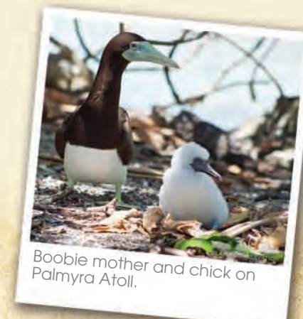
Booby mother and chick on Palmyra Atoll.

"And, every couple months, a wedge-tailed shearwater will come and try to land at Palmyra. During their breeding season, they'll come and try to nest there. But the rats, in the past, have prevented them from doing so. We're hoping that in a few years, they may actually establish and start nesting." ■