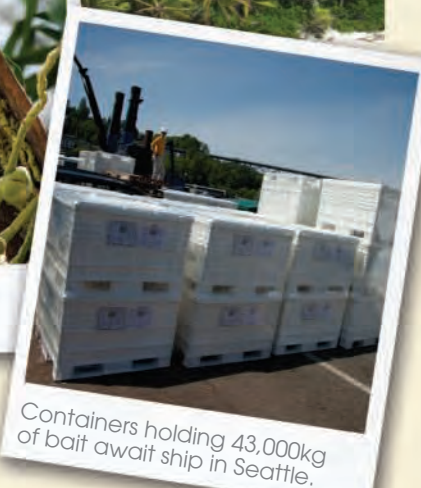
Containers holding 43,000kg of bait await ship in Seattle.

which is collaborating with FWS and TNC on the project.