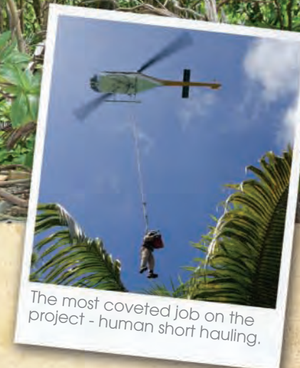
The most coveted job on the project - human short hauling.

There were other problems to work around. Palmyra's more than 110,000 nesting sooty terns and its thousands of red-footed, brown and masked boobies were in greater numbers than the pilots had previously experienced.