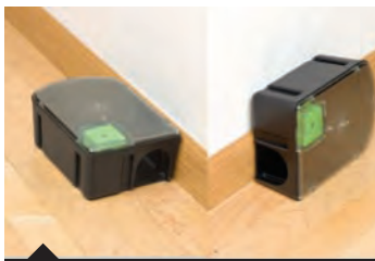
Use T1 RAT vertically or horizontally.

Available in December, T1 RAT is sold in 1-pack cartons and is labeled for individual sale, making it a desirable commodity for do-it-yourself and distributor showrooms or for public distribution by municipalities. ■