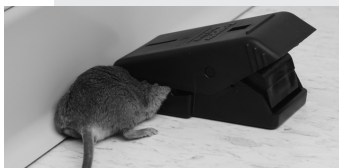
Even finicky mice can't resist this combo!