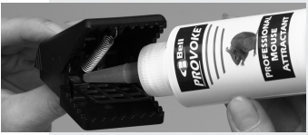
Apply PROVOKE Attractant directly to the trap.