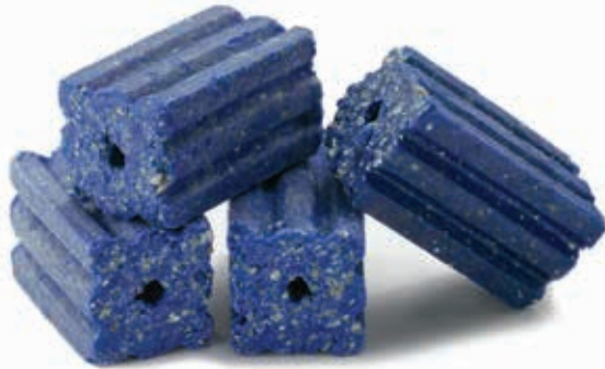
Photo may not be representative of a label-consistent bait placement