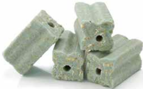
Photo may not be representative of a label-consistent bait placement