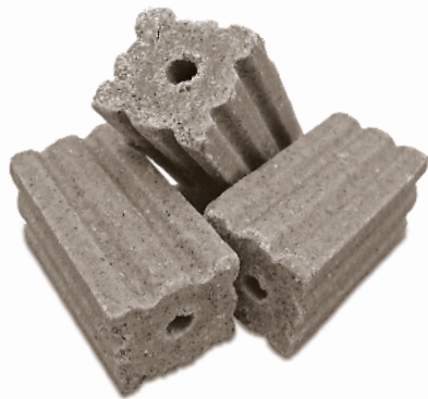
Photo may not be representative of a label-consistent bait placement