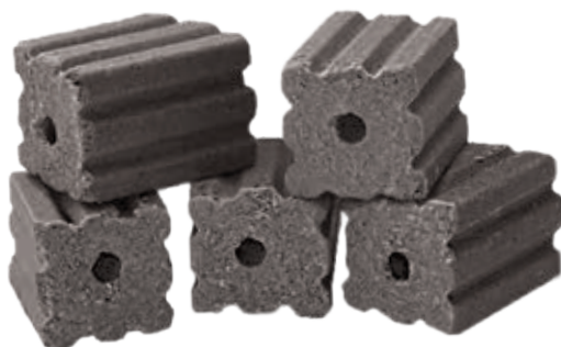
Photo may not be representative of a label-consistent bait placement.