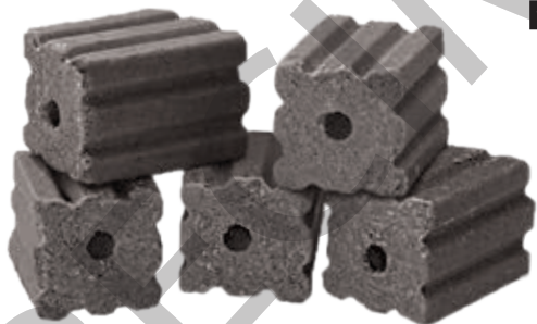
Photo may not be representative of a label-consistent bait placement.