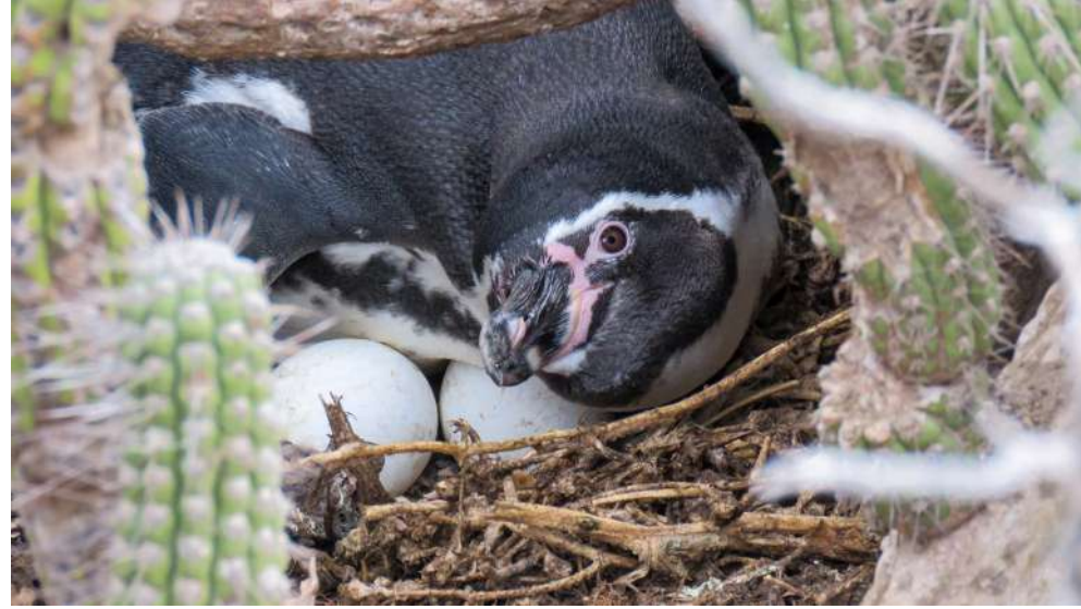
Humboldt Penguin in nest protecting eggs.

Today, the Humboldt Penguin National Reserve sustains 80% of the planet's remaining Humboldt penguins. ■