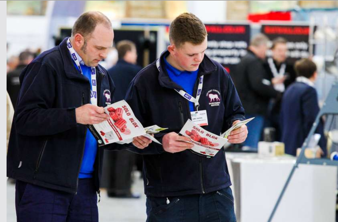
Solo Blox spotted on PPC Live Guides.

In February, Arnaud Del Valle, EMEA Busi-