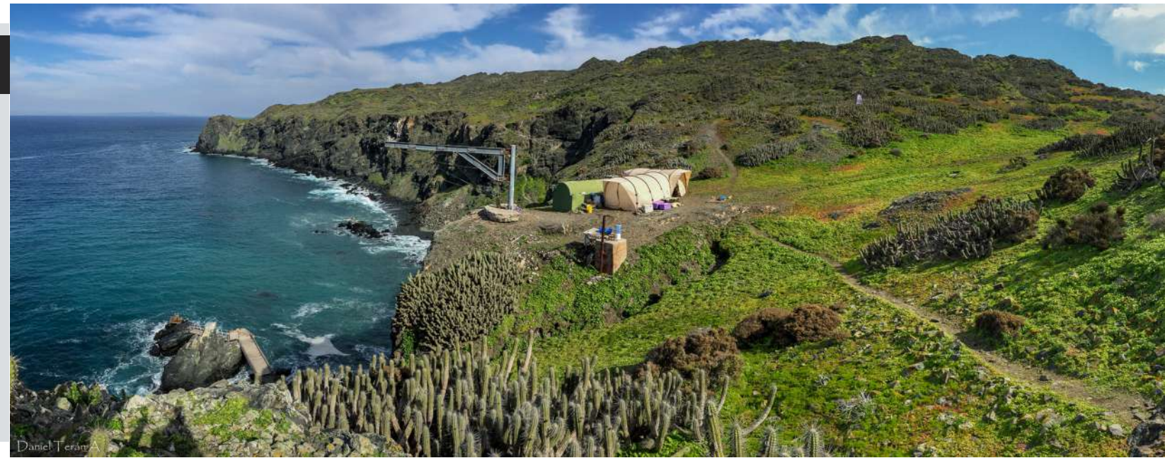
Camp set-up on Chañaral Island for research and observation.