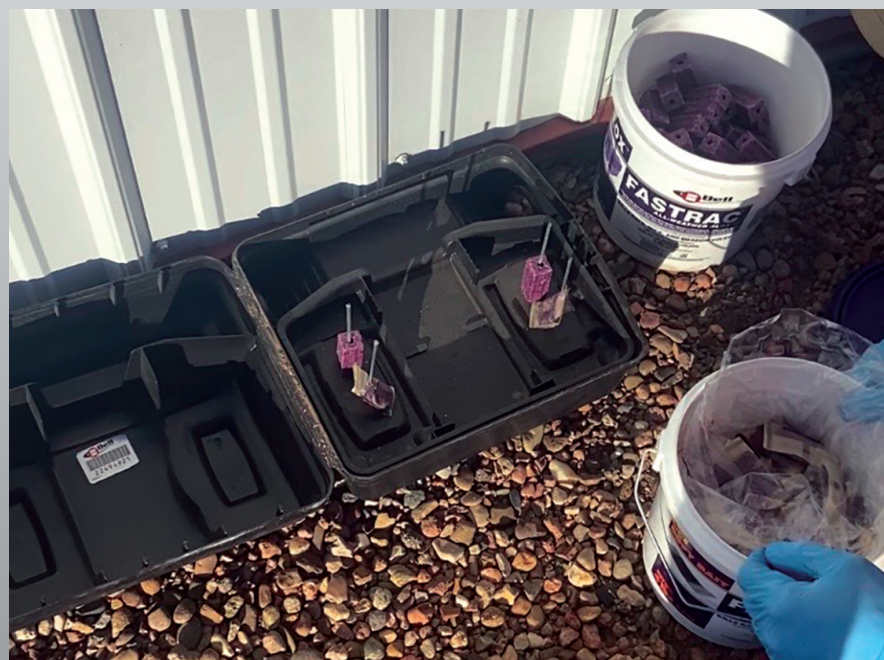
Exterior baiting with EVO Express

After the first week, we noticed that all of our stations in the attic had complete consumption. We also found heavy activity on all of our ground level stations. All unconsumed bait was disposed of, and replaced with fresh bait. After arriving on the second week, roughly thirty percent of the rodenticide was consumed in the attic, and minimal activity was documented on all ground level stations. Following our baiting application procedure from the previous week, new bait was placed and old bait was disposed of. The results from the third week of service using Fastrac were outstanding; Minimal to no evidence of rodent activity was documented at any bait stations throughout the entire facility. We continue to use Fastrac exclusively at this location. Results: A safe living environment for the dogs, and a very happy paying customer.”