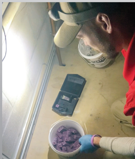
Interior baiting with Protecta Mouse