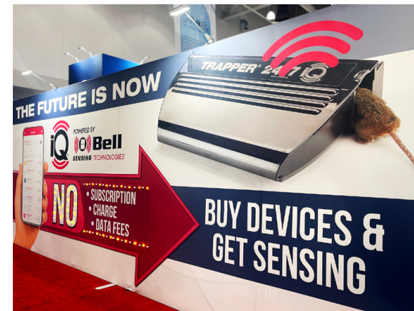
Bell announces no more subscription fee for Bell Sensing Technologies app.